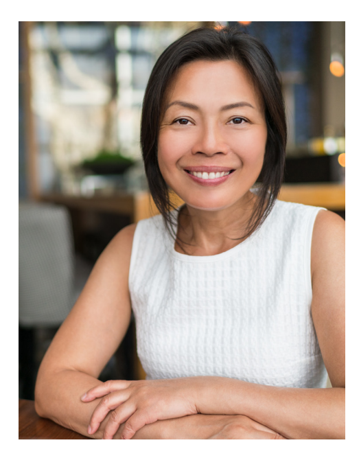
Learn more about these classes and others being offered at www.samcera.org/classes.

The ACFR is a great way to learn about the financial health of your retirement fund. To learn more about the fund, see the full 2023 Annual Comprehensive Financial Report, now available online at https://www.samcera.org/cafr/2023-acfr.